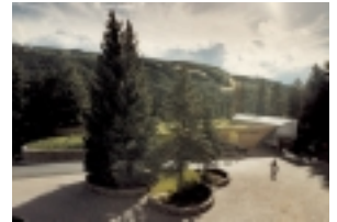
Vail Public Library

The Vail Public Library was designed in 1983 to be energy efficient and to have minimal impact on the environment. Our solution was an earth-sheltered building that protected against the cold north wind but opened out to the sunny south with views of Gore Creek and the ski mountains. The sod roof preserves green space and aesthetically blends the project into the indigenous environment of the Colorado Rockies. The solar heat gained in the atrium is recycled to provide space heating for the library. This building was the largest earth-sheltered public building in the west when it was built. It has been a showcase project regarding earth-shelter architecture and was featured in the magazine Solar Age . Author and Landscape architect, Sherry Dorward, featured the Vail library in her internationally acclaimed book, Design for Mountain Communities: A Landscape and Architectural Guide (1990, Van Nostrand Reinhold, New York).